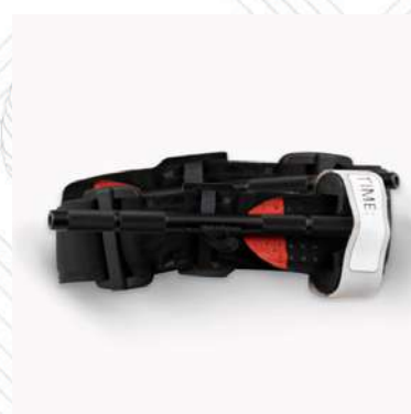
Tourniquet NOT INCLUDED