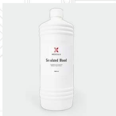
Simulated blood INCLUDED