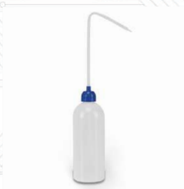
Application bottle INCLUDED